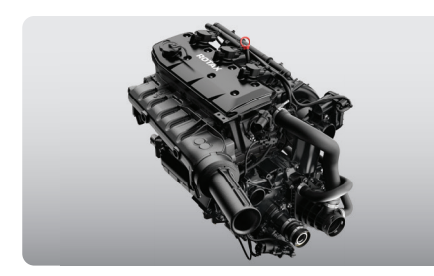
Rotax<sup>®</sup> 1630 ACE<sup>™</sup> – 170 Engine The Rotax<sup>®</sup> 1630 ACE<sup>™</sup> – 170 combines plenty of naturally aspirated power and economy, meaning the adventure can be exhilarating and prolonged.

Turn the LinQ Fishing Cooler into a livewell in seconds. An integrated pump constantly feeds fresh water into the reservoir keeping your catch or your bait alive all day.