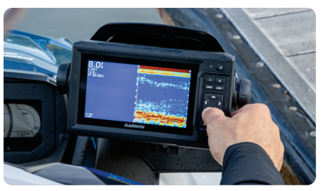
Garmin' 7" GPS & Fish Finder A top-of-the-line navigation, charting and fish-finding system using an in-hull transducer and mid-CHIRP sonar. Includes token for access to free upgraded regional maps.