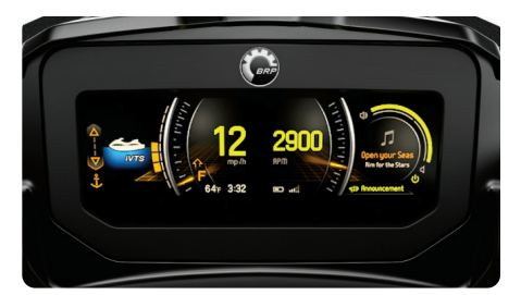
Full-Color 7.8" Wide Display Full-color display with incredible visibility and a new level of functionality. Bluetooth' and smartphone app integration provides music, weather, navigation and more.

An innovative hull that sets the benchmark for rough water handling, stability, and offshore performance.