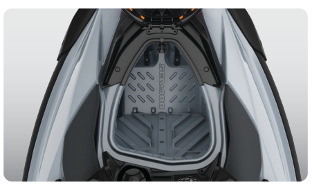
Large Front Storage

A deep-V design that offers unrivaled handling and acceleration and a new level of control at high speed.