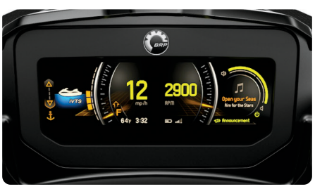
Full-Color 7.8" Wide Display (Optional)

The industry's first manufacturer-installed truly waterproof Bluetooth<sup>‡</sup> audio system.