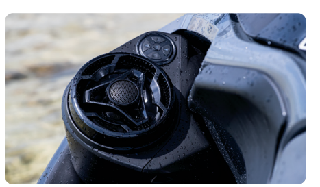
BRP Audio - Premium System (Optional)

A narrow seat profile with deep knee pockets and a revolutionary adjustable saddle that allows riders to lock in to the machine like never before.