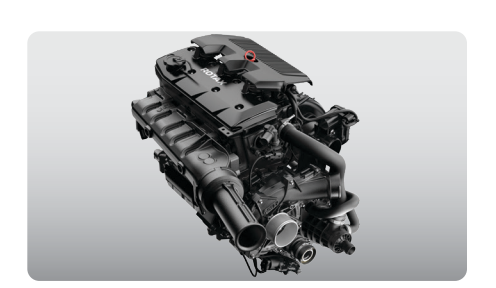
Rotax® 1630 ACE™ - 300 Engine

Full-color display with incredible visibility and a new level of functionality. Bluetooth and smartphone app integration provides music, weather, navigation and more.