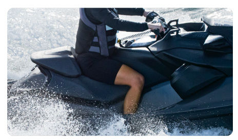
Ergolock™ R System

A narrow seat profile with deep knee pockets and a revolutionary adjustable saddle that allows riders to lock in to the machine like never before.